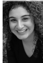
The Actress Teena Antia